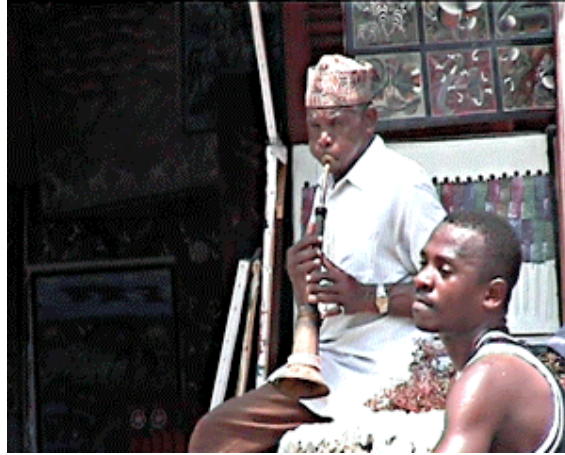
Enjoying some local music.....