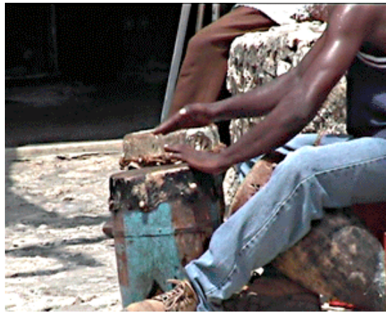
This is where Freddie Mercury emigrated to the UK from.