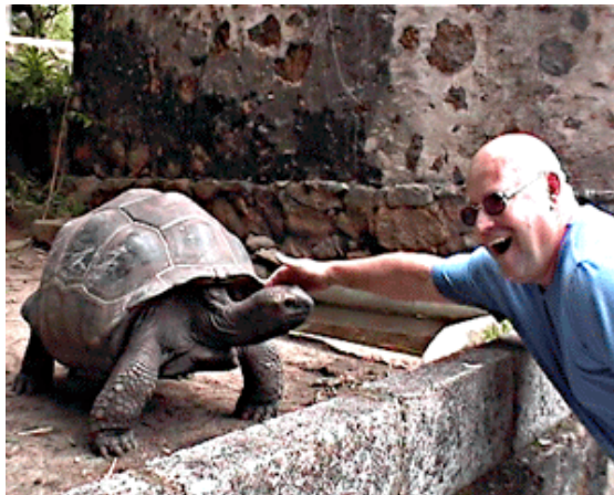
'Pirate Jack' meets an old acquaintance!!!!