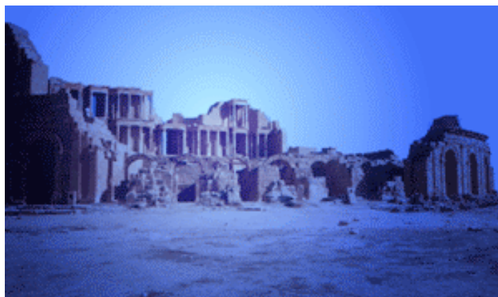
Libya was interesting - the tourists are more of a tourist attraction for the locals than the locals are for the tourists. Great roman sites though - with no tourists.