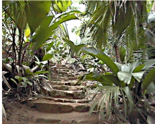
Lush green vegetation everywhere