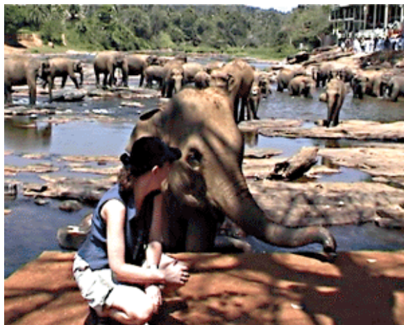
This is Pinnawela elephant orphanage where the elephants are led down to the river twice a day to bathe.