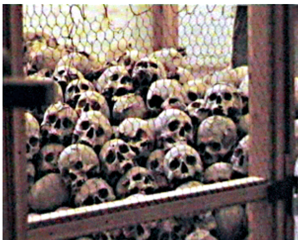
This is where the burning bush (Bible) still grows!!! And they have a lovely collection of monks skulls, as featured on the Antiques Roadshow. Derek Acorah would have a field day here!